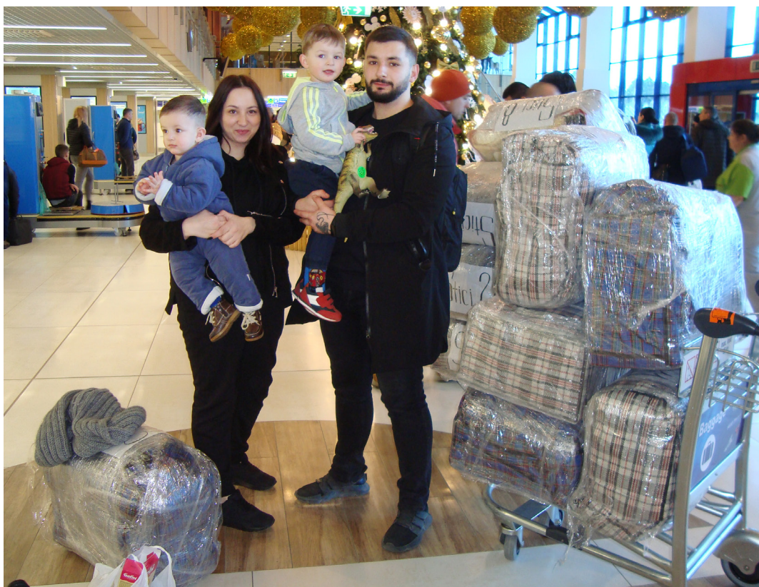
Top: A young family who made aliyah from Pyatigorsk earlier this year. Left: A family from Moldova who we helped to make aliyah.

Klith concerns the absorption of olim after they have arrived in Israel. It includes all aspects of integrating into society, including learning Hebrew, finding employment and housing, school enrolment and serving in the Israel Defense Forces (IDF).