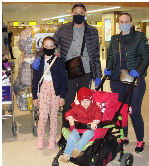
One of the families we helped

team, one of the fathers said: ‘You are more than a friend to our family...We consider you actually a part of our family!’