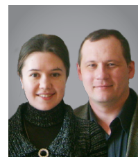
PAVEL & LINA MOLDOVA LEADERS